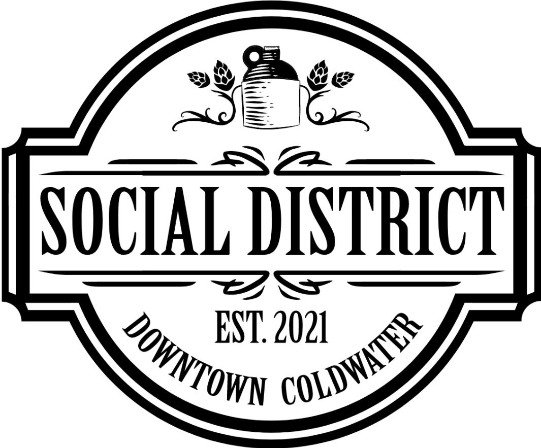
Exhibit A – Social District Logo