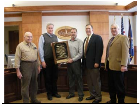
City of Coldwater "Paid - March 2011"

Over the past 30 years, the members refinanced the bonds several times, cutting interest rates in half, and also purchased other diesel generators. One-by-one the member communities have been paying off their portion of the MSCPA debt. On March 3 rd the MSCPA Board held its monthly meeting in Coldwater and presented the City with a plaque in recognition of paying off its share of the debt. The MSCPA is now officially debt free.