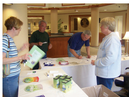
Coldwater residents taking part in our 1st Annual Earth Day event.

Although we are excited that this event will now take place on Earth Day annually, being "energy aware" and general conservation is something we would like to see customers focus on year round.