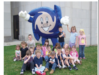
The United Methodist Preschool class with "Ernie Energy", the official mascot for Public Power.